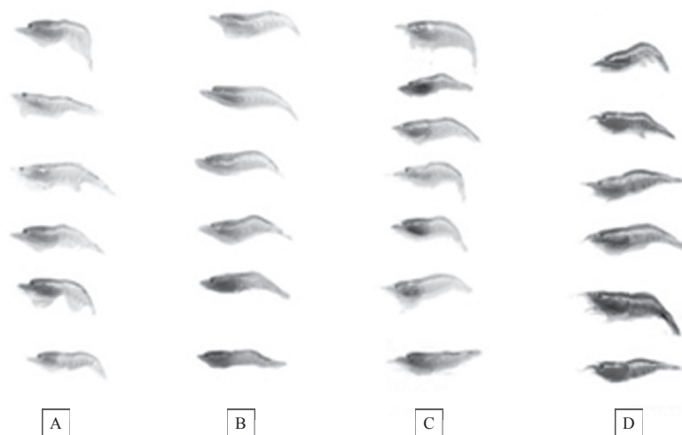
Figure 2. Red cherry shrimp after 8 weeks of feeding with natural carotenoid from marigold petal at various concentrations: 0 (A), 50 mg kg -1 (B), 100 mg kg -1 (C) and 200 mg kg -1 (D) diet.

Note: Means in the same column with different superscripts are significantly different ( P < 0.05 )